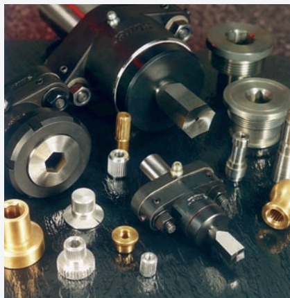
Above: Internal and external rotary broaching tools, with sample parts.

the rotary broaching tool/toolholder advances toward it. Because of the 1-degree axial tilt, only one corner of the tool engages the workpiece at first. When the tool makes contact, the workpiece drives the tool to rotate in unison with it. During rotation, first one corner of the tool contacts the workpiece, then the next, and so on, around and around.